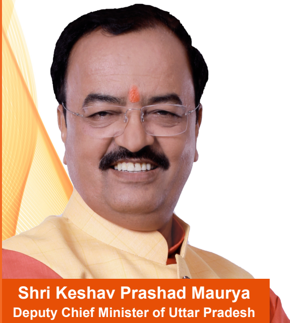
Shri Keshav Prashad Maurya Deputy Chief Minister of Uttar Pradesh